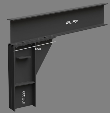
DETAIL - A